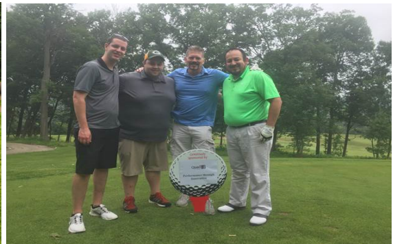
A few more teams enjoying the day